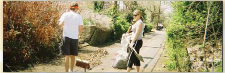
Francis G. Slay Mayor, City of St. Louis

Place all bulk items at your bulk pick-up site by 6 a.m. on Monday after your designated Blitz clean-up weekend