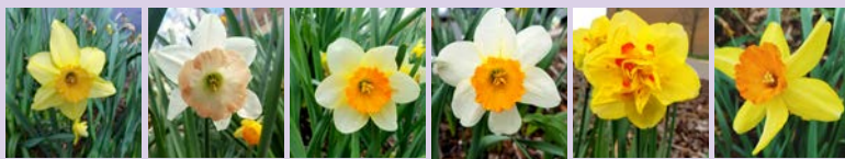
CARLTON PINK CHARM BARRETT BROWNING SLIM WHITMAN TAHITI SUADA

ORDERS WILL BE AVAILABLE FOR PICK UP AT THE FOREST PARK GREENHOUSE ON FRIDAY, OCT. 13 FROM 11:00 a.m. to 6:00 p.m. & SATURDAY, OCT. 14 FROM 9:00 a.m. to 1:00 p.m.