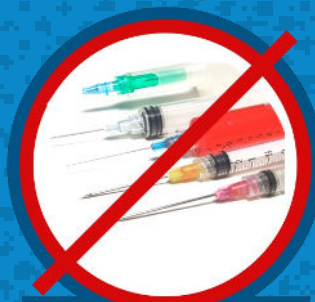
Sharps & Needles