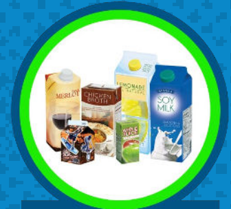
Food & Beverage Cartons

Keep items loose, clean & dry. Always flatten your cardboard.