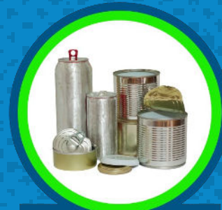
Metal Food & Beverage Cans